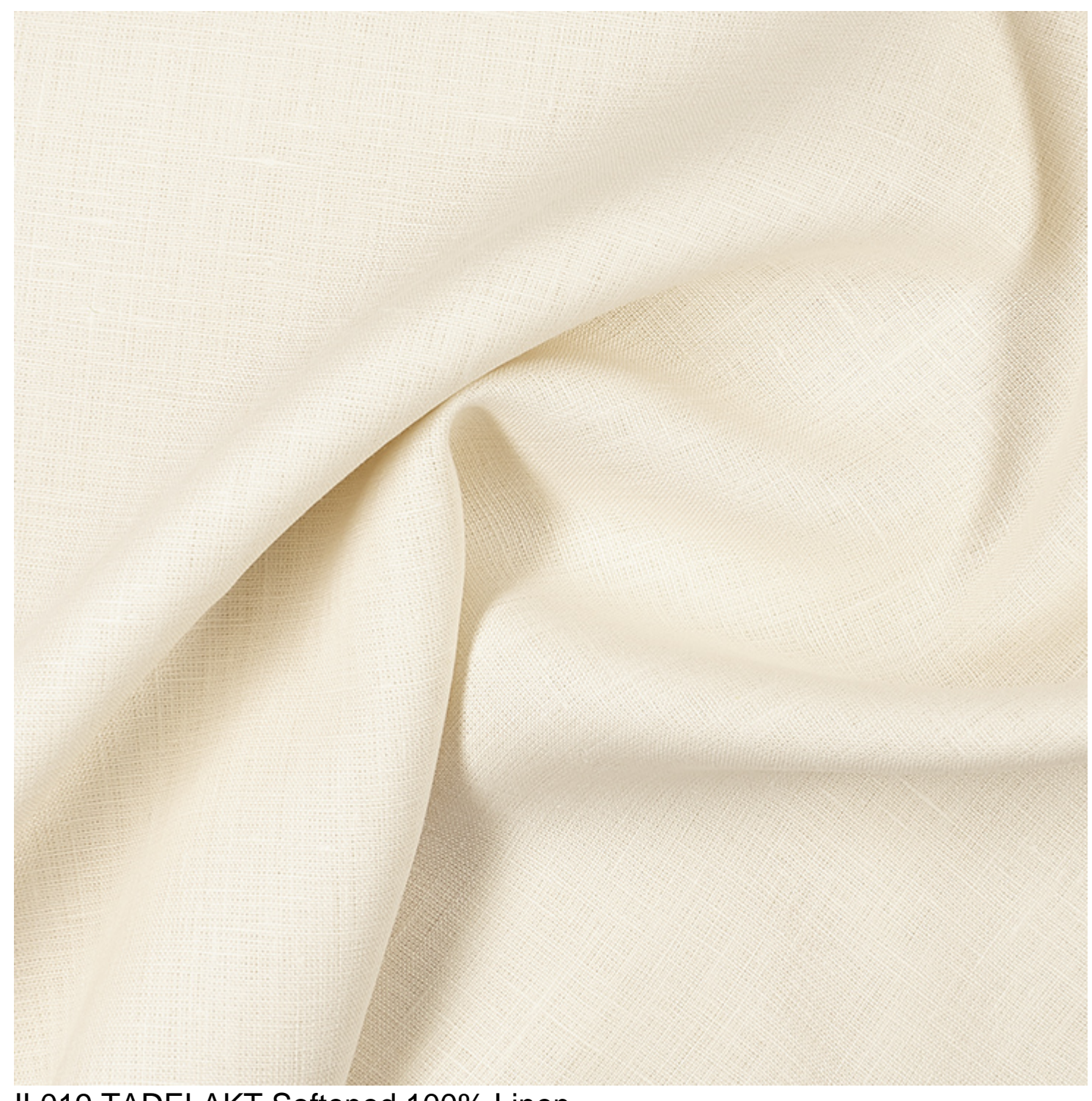
IL019 TADELAKT Softened 100% Linen

The Mélilot pattern exists in paper and PDF formats and is available for purchase at the Deer and Doe <u>website</u>. For more inspiration, please check all the beautiful makes on Instagram with the <u>#ddmelilot</u> hashtag.